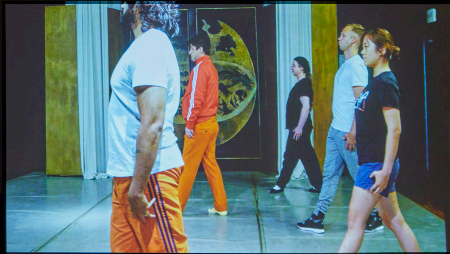
Mime Work; making the invisible visible , Projected Single-Channel Video 10 Min Looping, 96”X4”X54”