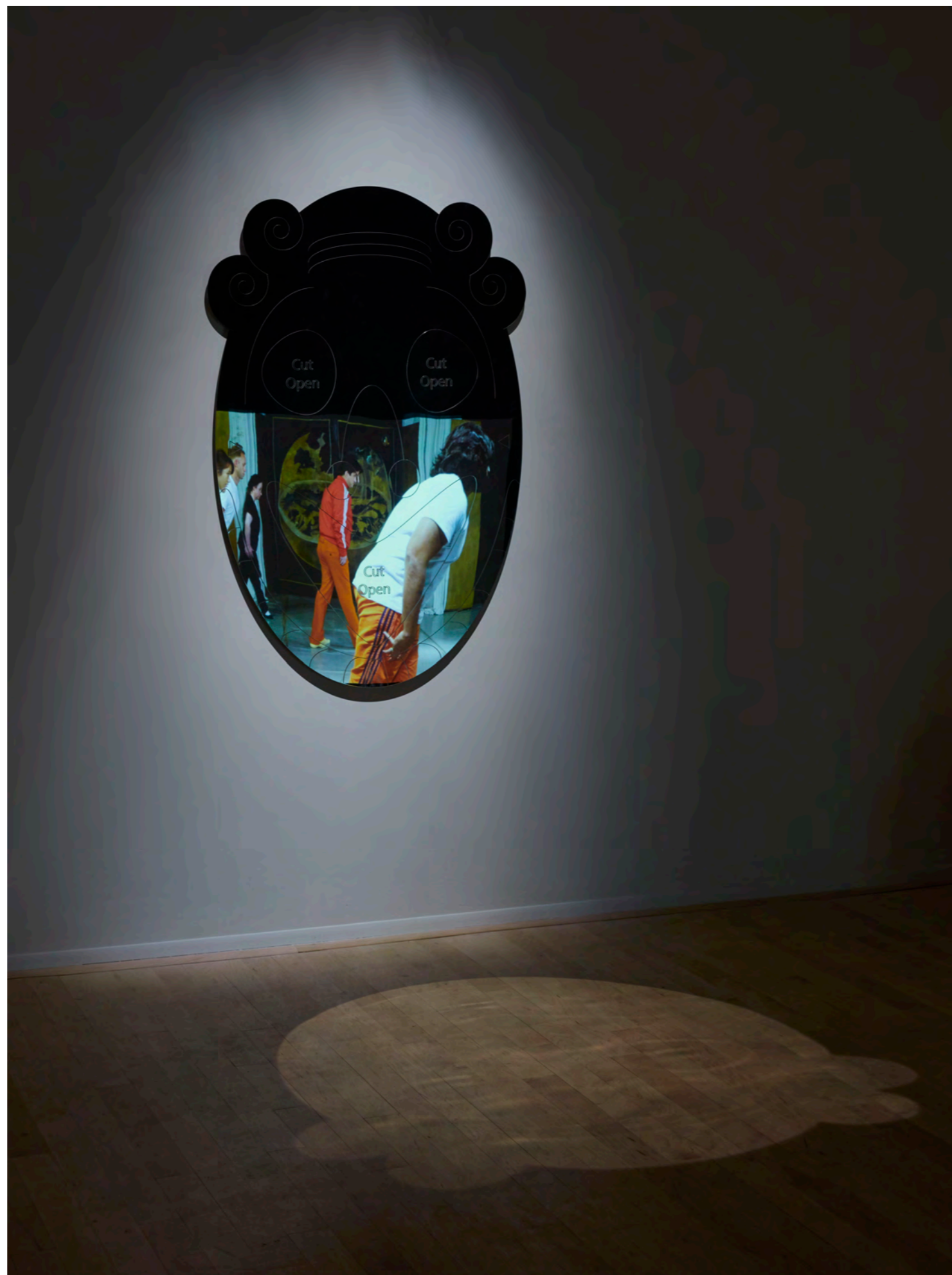
Cut-Open-Smile, Bronze Mirror Acrylic, 50" X 46" X 1/8"