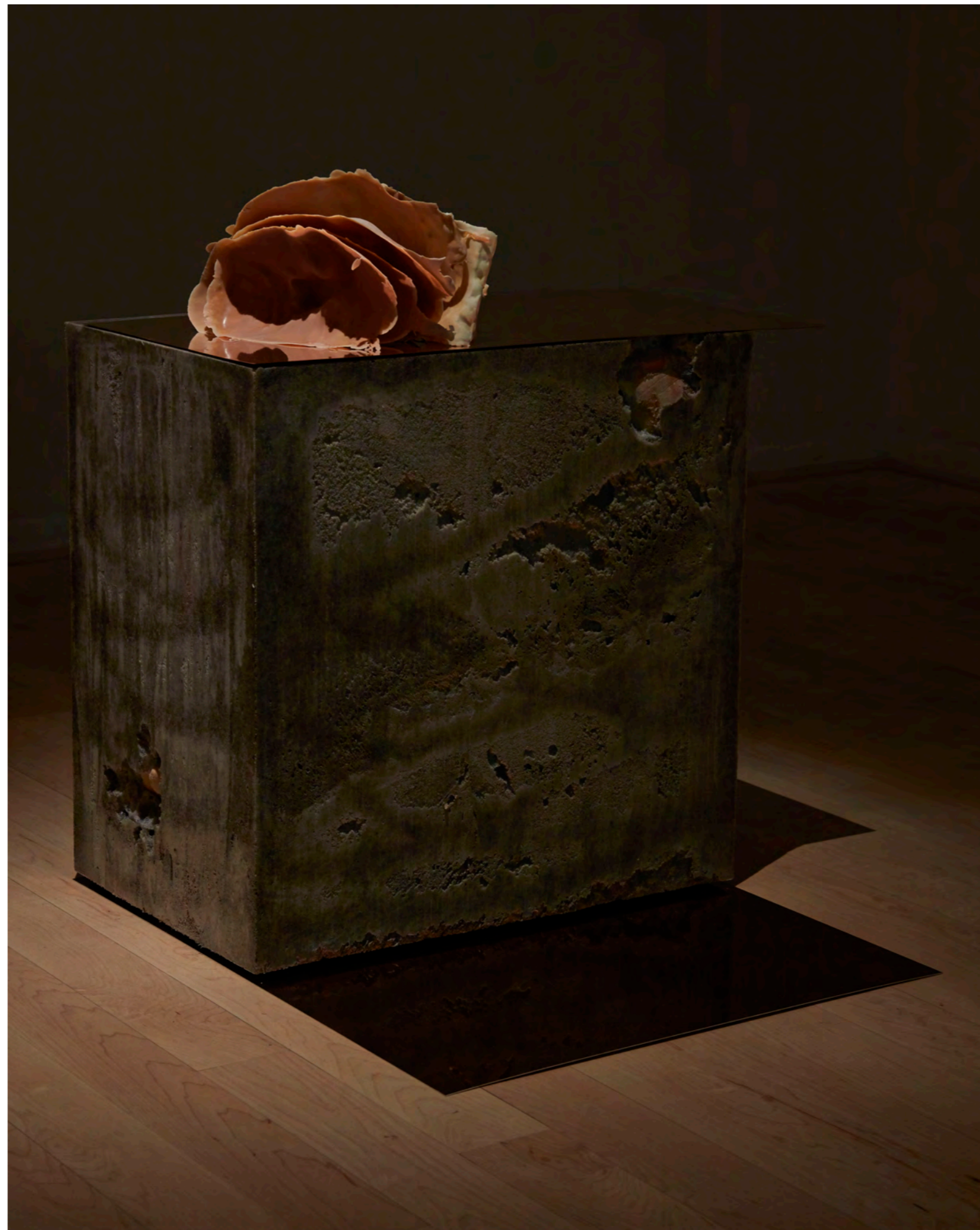
Prosopon, the word for face , Polyfoam, Silicone, Copper, and Bronze Mirror 24" X 12" X 16"