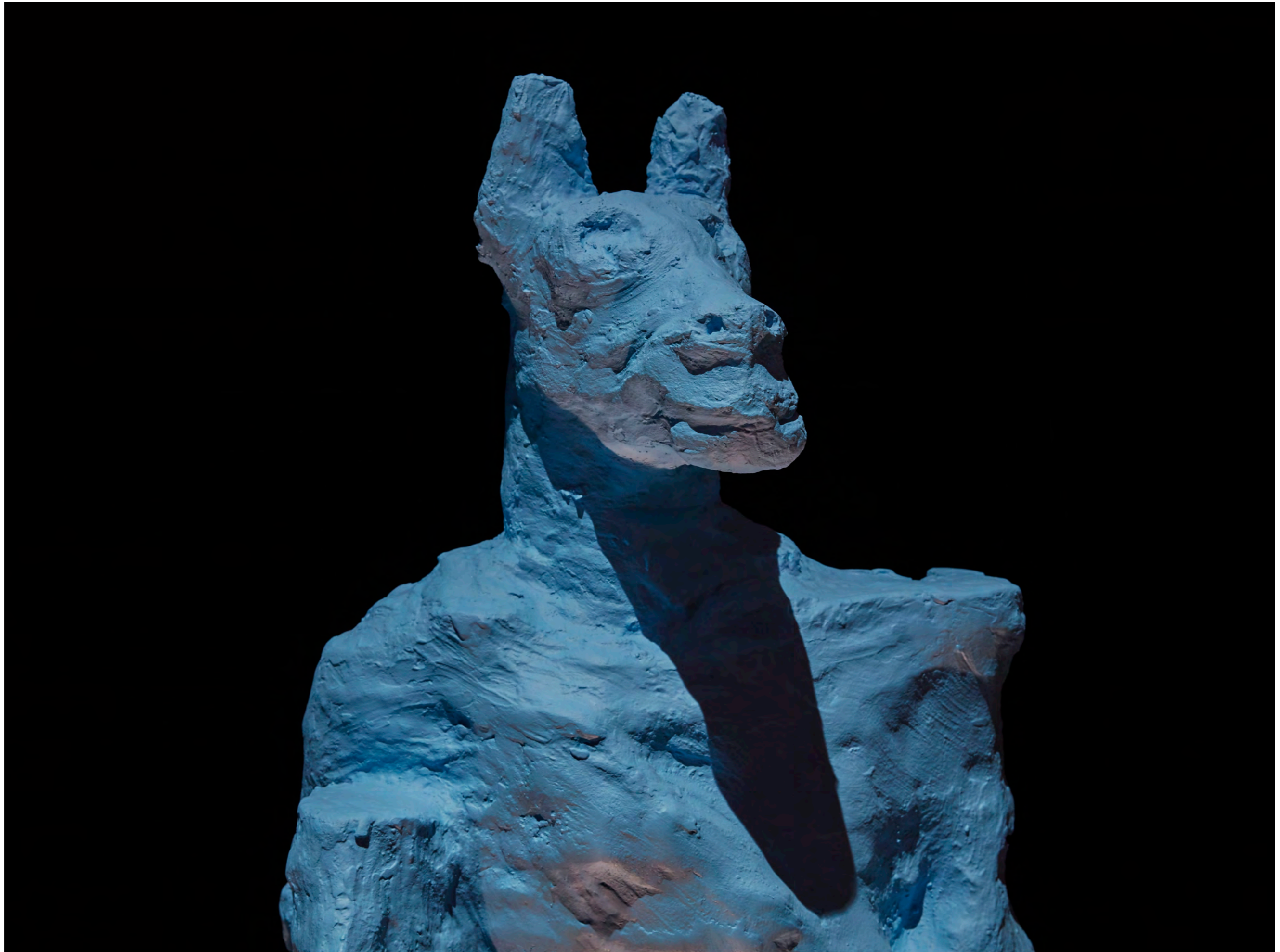
Detail of Hermanibus , Stack Laminated Foam, Foam Coat, Polyfoam, Silicone, Copper, and Bronze Mirror 24" X 36" X 78"